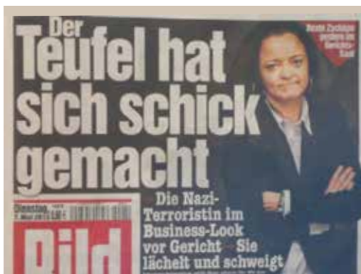
“The devil got all dressed up.” Germany’s main tabloid Bild reports on the NSU trial on 7 May 2013, featuring Beate Zschäpe on the cover page.

Later, when Zschäpe handed herself over to the police, rather than analysing the trend of women in violent right-wing organizations or Zschäpe's biography itself, much time (in particular by the media) was devoted to assumptions about the presumed sexual nature of her relationship with the other two key members of the cell, and her having played a negligible and passive role in the trio's violent crimes. This demonstrates how women's importance in violent extremist groups is measured and valued against their relationship with men, leading to dangerous blind spots in investigations of violent extremism.