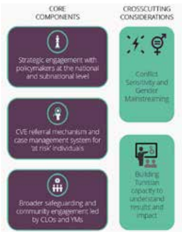
Figure 1: The Jendouba Model

drawing on Dutch and other international good practices. The first 18 months of the programme worked to establish a feasible model, led by the police in close collaboration with the municipal government and other community-based resources.